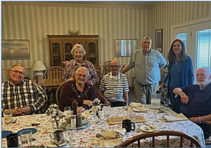
Brothers of the Albany NY Community had a special dinner to thank the nurses who watch over their health needs.