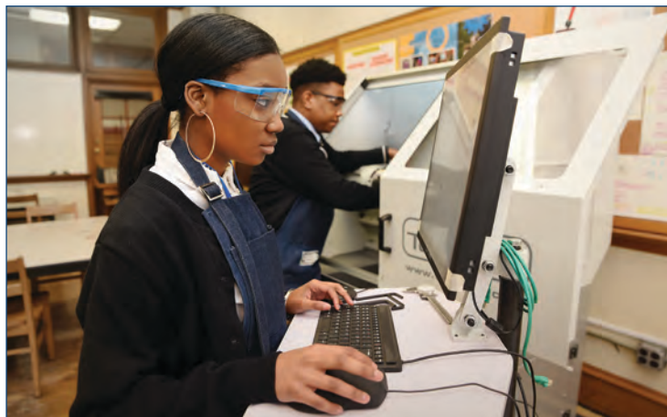
Students work in the Engineering Lab.

Most importantly, students at West Catholic Prep continue to excel academically, socially, and personally. Their achievements serve as a testament to the transformative power of a Lasallian education. The energy in the school community is palpable, serving as a reminder that dedication, innovation, and commitment can lead to remarkable accomplishments, shaping not only the trajectory of their institution but also the futures of their students.