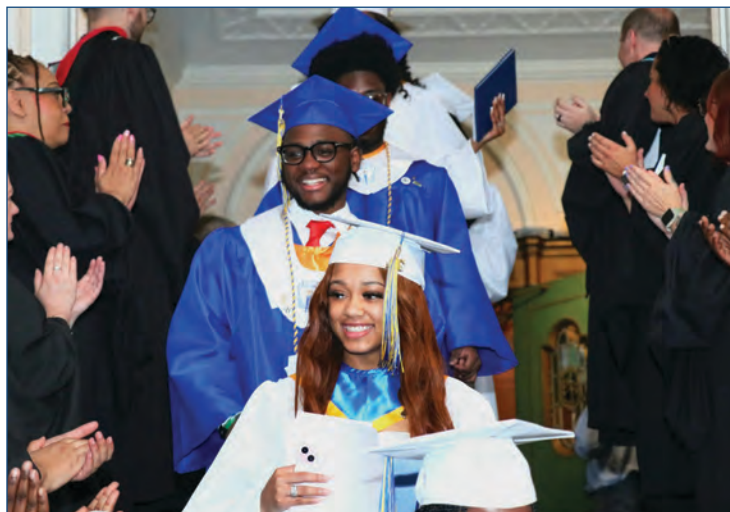
Faculty members applaud new graduates.