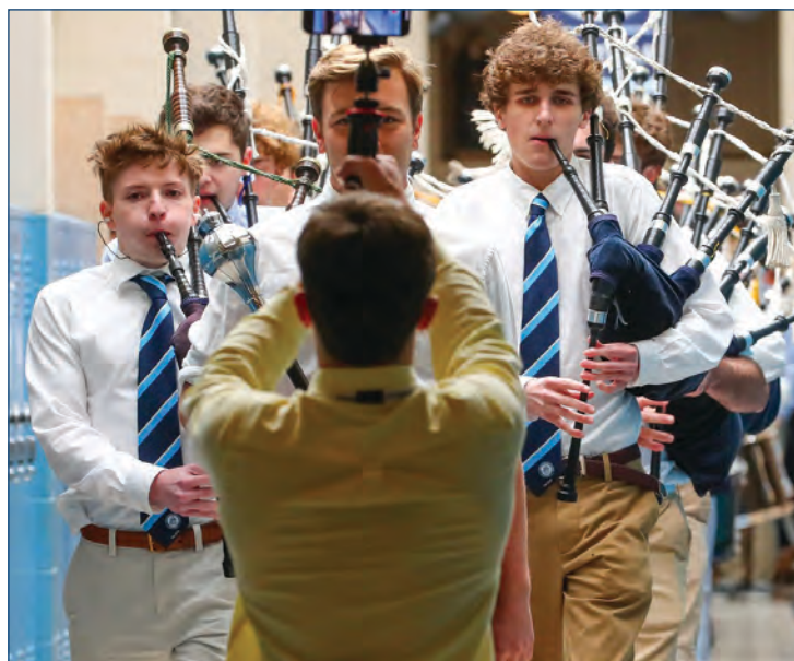
The Pipe & Drum Band at Christian Brothers Academy in Lincroft NJ leads seniors out of school year on their last day of classes.

ceremony in which they burn their burdens in an open fire. The rising smoke symbolizes releasing the burdens so they are “rising up to God”. The San Miguel middle school students take this beautiful tradition very seriously every Lenten season.