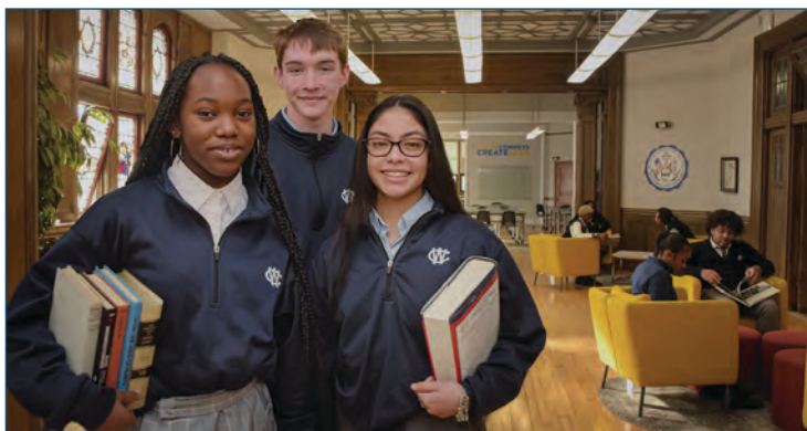
Students make use of the Learning Commons, soon to be renamed The Connelly Center for Academic Excellence.