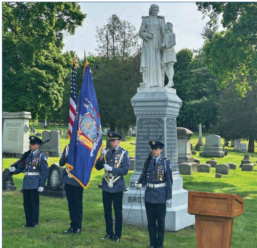
Members of the La Salle Institute, Troy NY, Color Guard and Honor Guard take part in the memorial ceremony on Founder's Day.