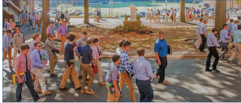
Students at Central Catholic High School in Pittsburgh PA “Walk the Quad.”

There is a long-standing tradition at La Salle Academy in Providence RI which started in 1941 after four Brothers and a stonemason completed the campus Grotto in honor of Mary “Our Lady of Grace.” Soon after, football teams began kneeling in prayer at the Grotto before both home and away games. Over the years, other athletic teams joined the tradition. Now, young men and women on teams from field hockey to lacrosse, cross country to tennis, go to the Grotto. The student-athletes kneel in silent prayer and then are led in vocal prayer by one of their team captains. It is remarkable to see young men and women offering their coming efforts to God, through the intercession of Mary. It has become an iconic tradition that takes place almost every afternoon during the fall and spring seasons.