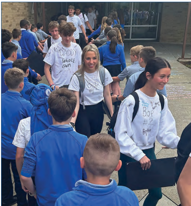
At LaSalle Institute in Troy NY, sixth grade students line the walkway to cheer the departing seniors on their last day.

At the San Miguel School of Providence RI there is a Lenten tradition that began shortly after their founding in 1993, and includes an ancient tool used by Native Americans. Students are encouraged to write down on a slip of paper any troubles they may have and place them in a large wicker basket with tribal feathers called the “Burden Basket.” On the last school day before Easter, the school community goes outside together for a