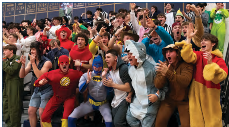
Students at La Salle College High School in Wyndmoor PA wear fun costumes and sing Silent Night after each win.

Some Lasallian school traditions are serious while others are light hearted, but they all have the deeper meaning of being inspired by the ideals of Saint John Baptist de La Salle. Traditions help to connect students to their shared values and faith, and they foster harmony among the school community. This creates long lasting bonds of affection between students and their schools helping to ensure continuity for the Lasallian mission.