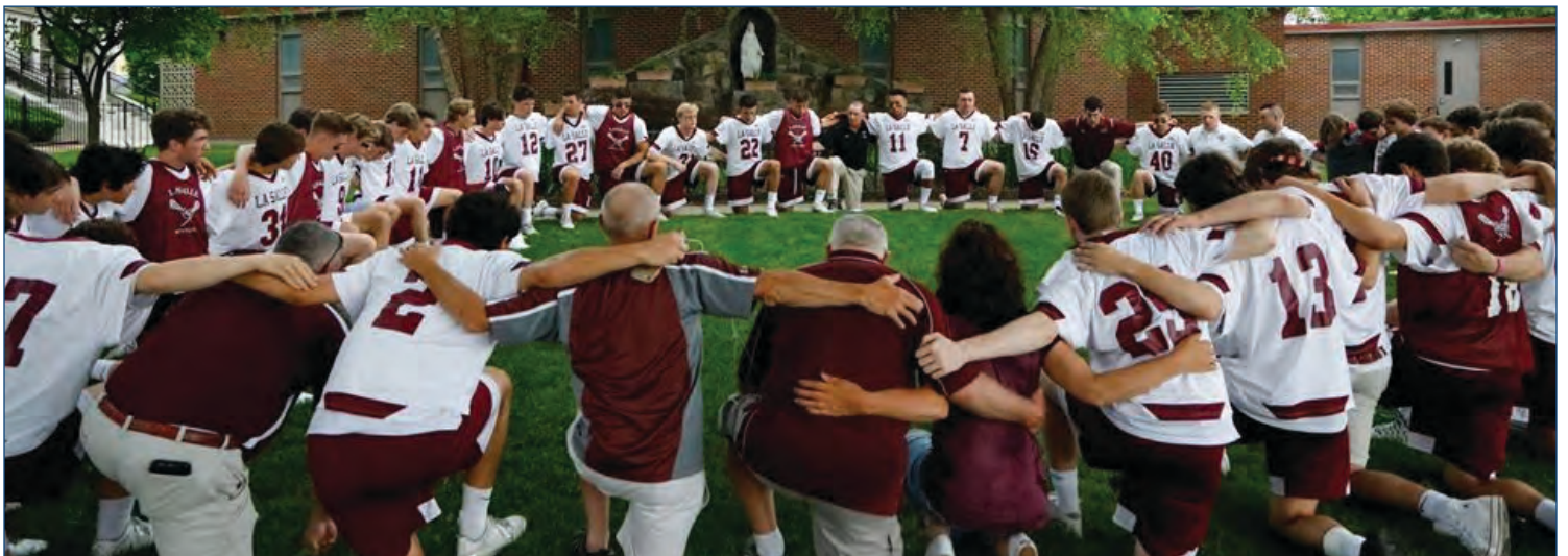
La Salle Academy, Providence RI Lacrosse team prays at the Grotto before their game.